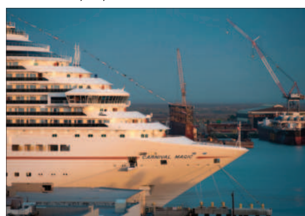
Carnival Cruise Ship Magic at the Texas Cruise Ship Terminal at the Port of Galveston.