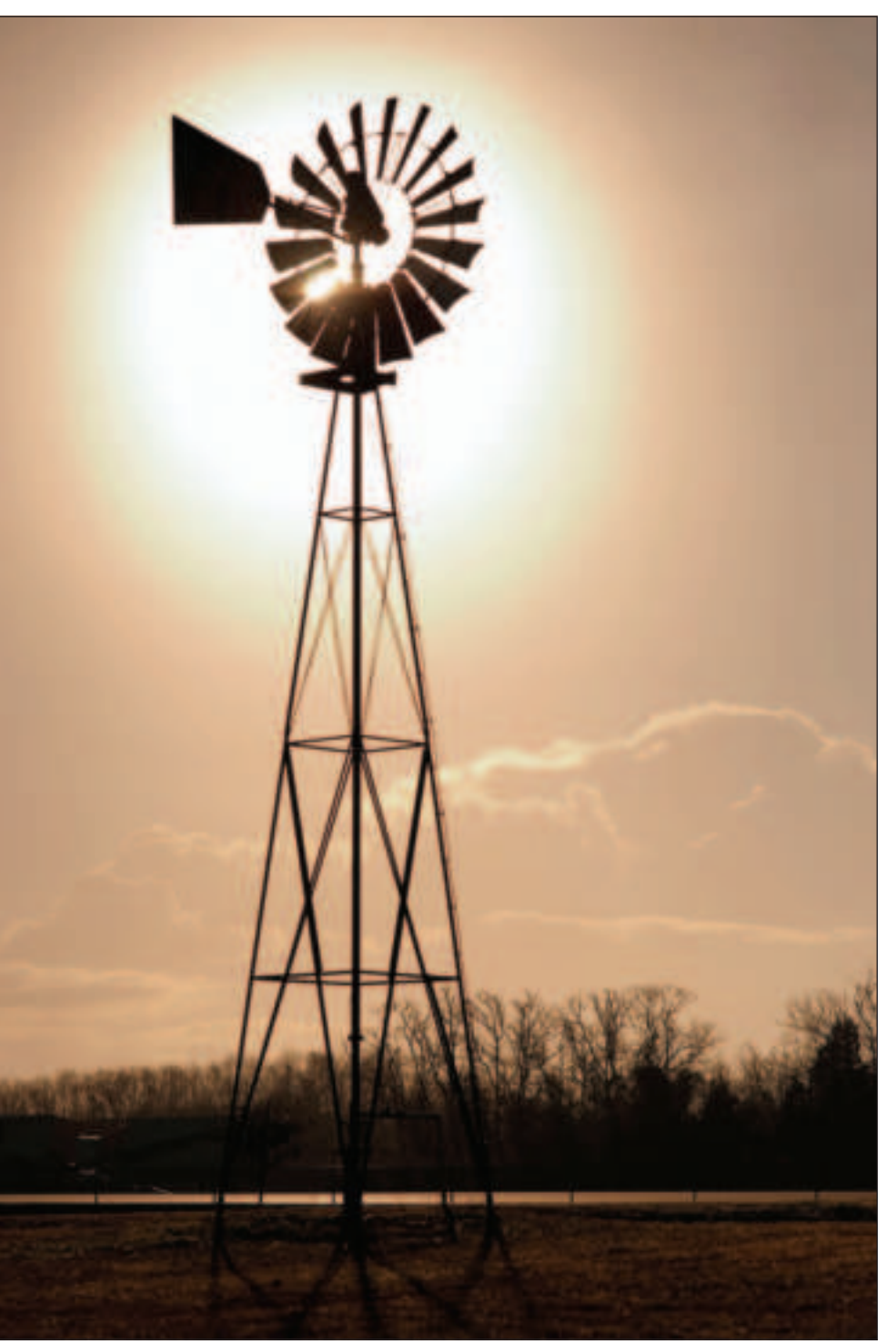
A windmill is silhouetted at sunrise on land owned by WestWind Helicopters in Santa Fe. The windmill pumps water into the pond.